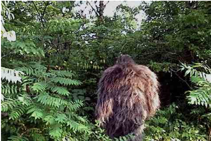
We thought it was a bear, but the local Forest Service Agent we showed our picture to said, 'That ain't no bear you saw. Bears don't walk on two legs.'

Bigfoot Museum Copyright 2006-2009 OurBigfoot.com