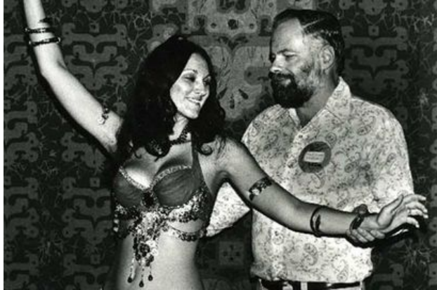
Philip K Dick enjoying some of the side attractions at an SF convention in 1972.