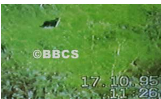
Unidentifed, possible ABC in an unknown location

This is not to deny that many supposed ABCs are misidentifications of indigenous animals; but over the years, the scepticism of the experts has been worn away by the many anecdotal reports from experienced observers, and the evidence from spoor, livestock depredation, video footage, and alien felids trapped or shot [see panel]. The orthodox explanation now invokes escapes from unspecified unlicensed private zoos or owners, and hypothetical overturned circus trailers.