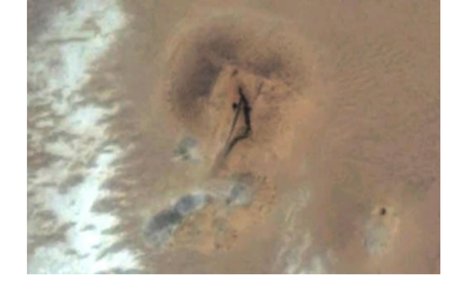
Peruvian Pyramids that look like regular hills due to erosion: The pyramids of Tucume, Peru known as "the Valley of the Pyramids".