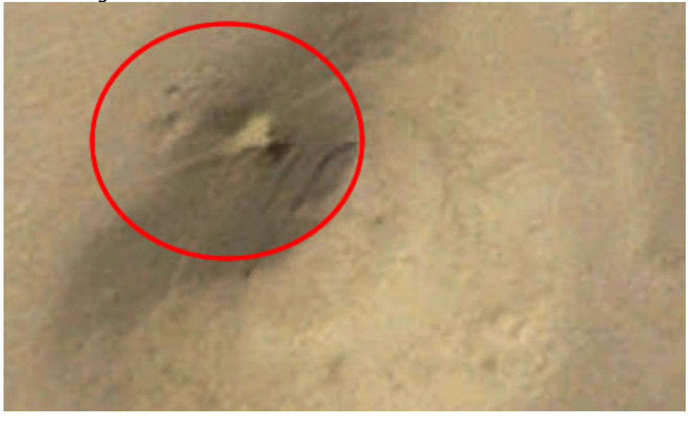
Recent images of the "mound" site show evidence of someone digging into the "mound".