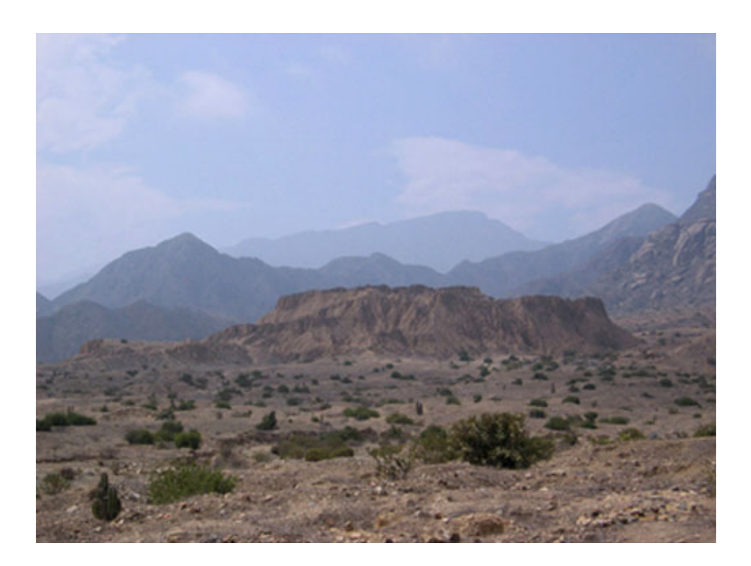
Pyramids are heavily eroded.