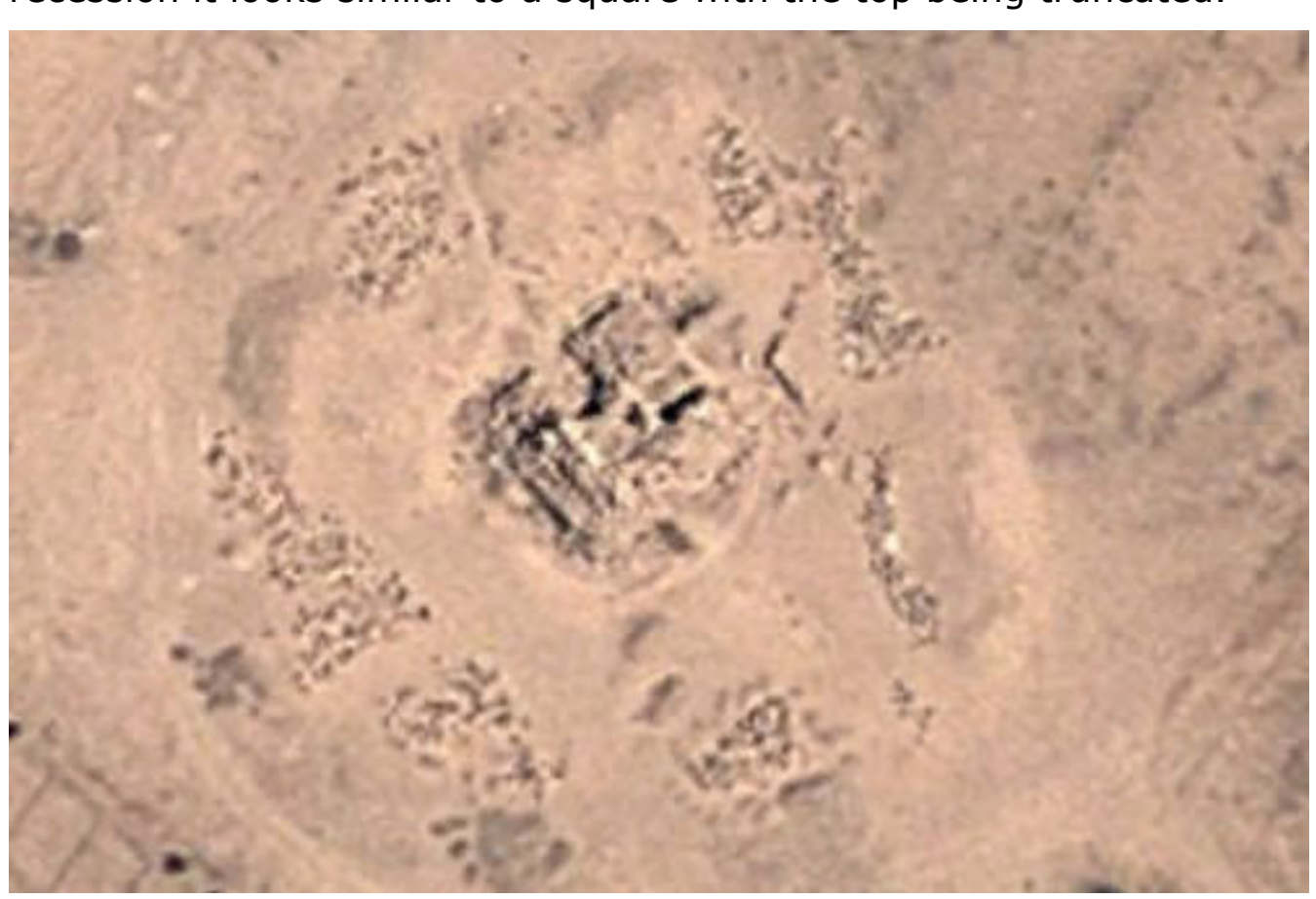
Close-up of the two smaller "mound" sites.

Pyramid of Sinki in Egypt. Notice the central area of the pyramid is a recession it looks similar to a square with the top being truncated.