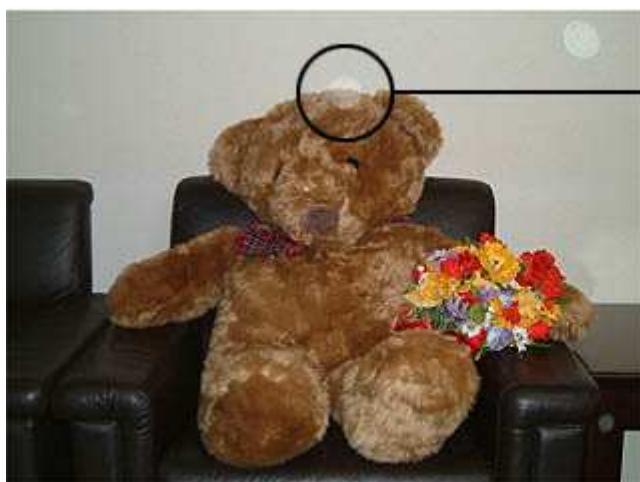
Round white dots in the image

When you take pictures using the flash, whitish round dots appear in various parts of the image.